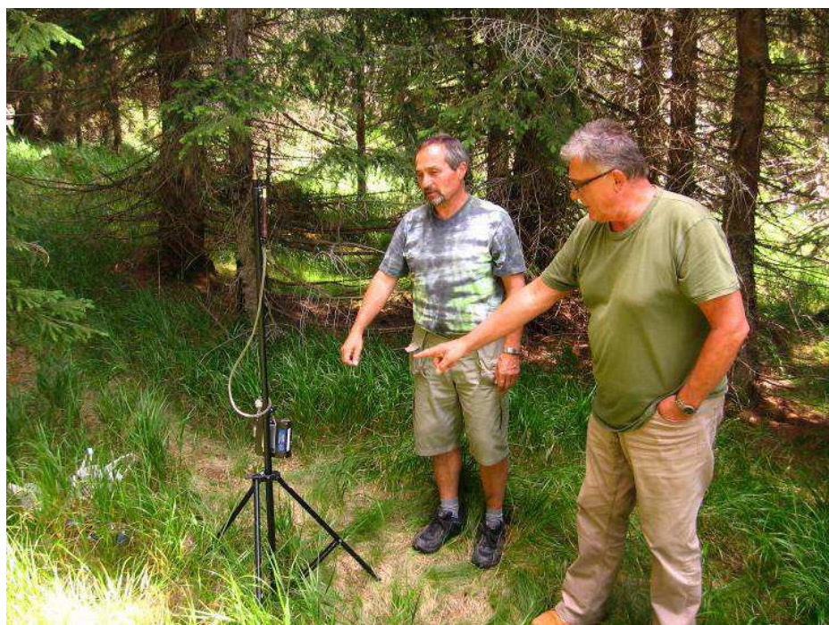
Figure 1 Sampling place Brezník – Healthy forest (odběr na trubice s tenaxem TA)

After the evaluation of obtained data from the collected sampling it was found out that the concentration of alpha pinene in the collected forest air in the places of the “dead” forest was analysed uniformly below 0.2 \mu\text{g}/\text{m}^3 . The positions, located in a living forest, alpha pinene concentration ranges from 0.2 \mu\text{g}/\text{m}^3 in the Brezník place, over 0.32 \mu\text{g}/\text{m}^3 in the Poledník place, to 0.45 \mu\text{g}/\text{m}^3 in the Modrava place. The project protocol, including graphic documentation and detailed summary of climatic conditions was completed and archived.