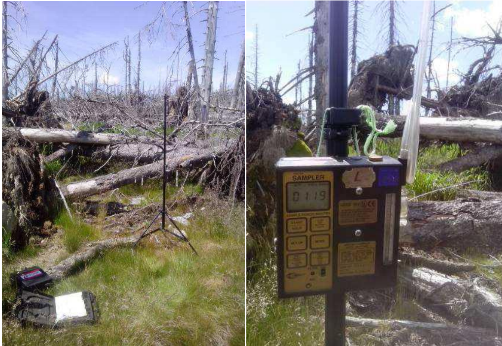
Figure 2 Sampling place Breznik (Mokruvky) – Dead forest (sampling on tubes with Tenax TA)