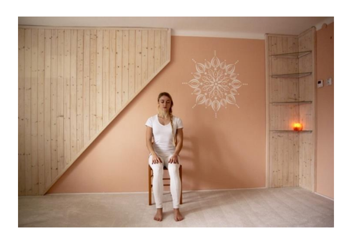
Figure 1 Environment, where the shooting of the intervention "Life in Balance" took place (Stránská, 2021)

The process of editing and sounding (post-production) took place in the iMovie program using a GXT 232 microphone with a pop filter, when it was necessary to record the entire recording. Subsequently, the "PALESTRA" logo was created in the graphic program Adobe Illustrator CC 2018, which was used in the introductory sequential jingle and made introductory and concluding captions.